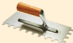
28x12 cm trowel stainless steel Ø 15 mm rounded serrations