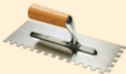
28x12 cm trowel stainless steel 10 mm square serrations