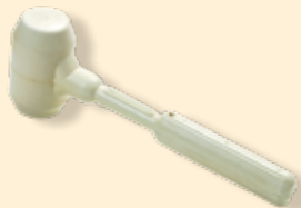
White rubber mallet