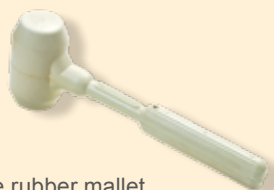
White rubber mallet