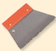
6x6 mm trowel