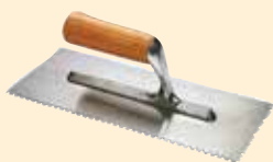
28x12 cm trowel stainless steel 3 mm square serrations