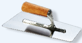
28x12 cm smooth trowel