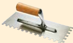
28x12 cm trowel stainless steel 10 mm square serrations

application, but avoid any ponding / standing water on the surface, which must not be damp to touch and not with a dark-matt / wet surface appearance i.e. it must be saturated surface dry (SSD).