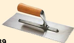
437189 28x12 cm trowel stainless steel 8 mm square serrations