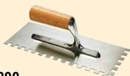
437200 28x12 cm trowel stainless steel 10 mm square serrations