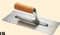
437189 28x12 cm trowel stainless steel 8 mm square serrations