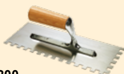
437200 28x12 cm trowel stainless steel 10 mm square serrations