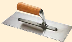
8x8 mm trowel