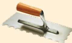
28x12 cm trowel stainless steel 15 mm rounded serrations

Depending on the substrate condition and contaminants to be removed from the surface, perform adequate preparation techniques, such as water-jet washing or blastcleaning, in order to remove all traces of any materials that could reduce the product's adhesion to the substrate. Cracks in substrates must be identified and sealed appropriately e.g. with REPAIR epoxy resin. On non-absorbent or substrates with limited absorbency, such as existing ceramic tiles etc., check to confirm that these surfaces are all firmly and securely bonded and stable, then use suitable degreasing/descaling products to thoroughly and completely clean the surface e.g. with DET-BASICO and DET-ACIDO.