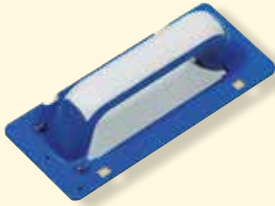
Handle for sponges and felts