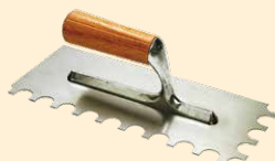
Trowel stainless steel Ø 15 mm rounded serrations