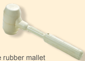
White rubber mallet