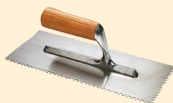
Trowel stainless steel 8 mm square serrations