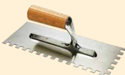
Trowel stainless steel 10 mm square serrations