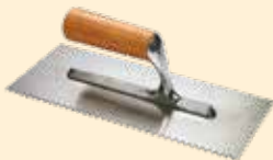
28x12 cm trowel stainless steel 8 mm square serrations