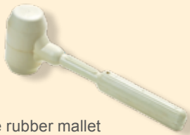
White rubber mallet