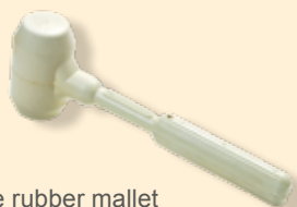
White rubber mallet