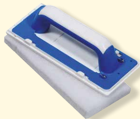
Soft white felt