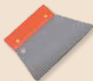
3x3 mm trowel