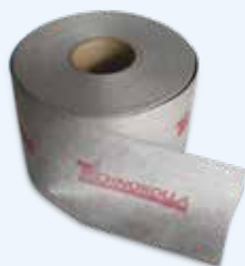
437337 Strip RL 120