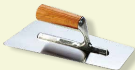
28x12 cm smooth trowel