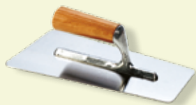
28x12 cm smooth trowel