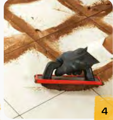
Apply the epoxy grout with a rubber trowel.