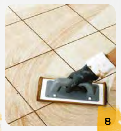
Complete the cleaning with a damp soft sponge, cleaning it frequently with a good amount of water.