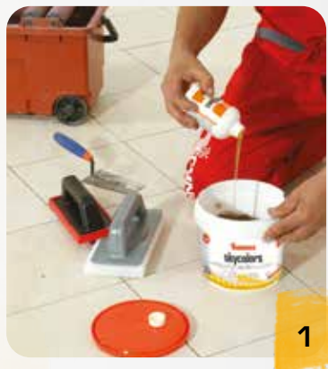
Pour all the catalyst (component B) into the paste (component A).