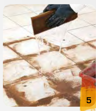
Wet the freshly grouted surface with a good amount of clean water.