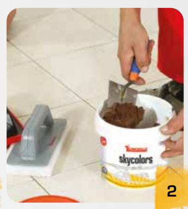
Mix the two components with a spatula.