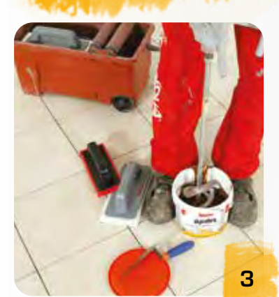
Mix the two components with a low-speed