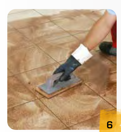
Level the surface using wet soft felt pad, cleaning it frequently with a good amount of water.