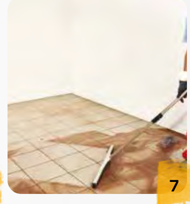
Clean the still fresh surface with grout spreader.