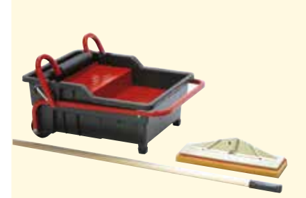
Washing trough with rollers + float on handle