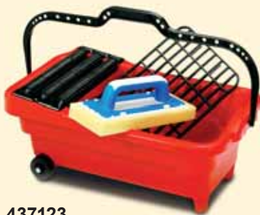
437123 Washing trough with 3 rollers