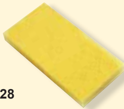
437128 Sweepex sponge