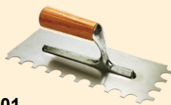
437201 28x12 cm trowel stainless steel Ø 15 mm rounded serrations