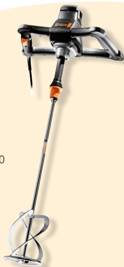
437145 Blender 1200