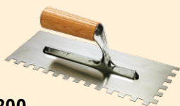
437200 28x12 cm trowel stainless steel 10 mm square serrations