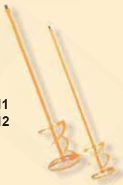
TKW 411 TKW 412