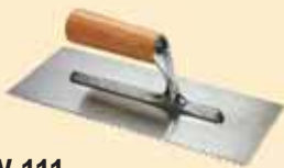
TKW 111 Trowel 8x8 mm