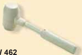
TKW 462 White rubber mallet