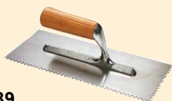
437189 28x12 cm trowel stainless steel 8 mm square serrations