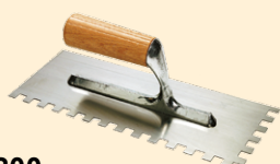
437200 28x12 cm trowel stainless steel 10 mm square serrations