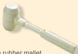
White rubber mallet