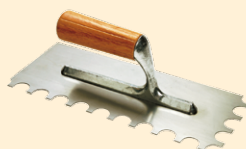
28x12 cm trowel stainless steel Ø15 mm rounded serrations