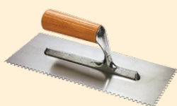
28x12 cm trowel stainless steel 8 mm square serrations