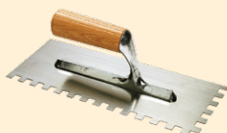
28x12 cm trowel stainless steel 10 mm square serrations