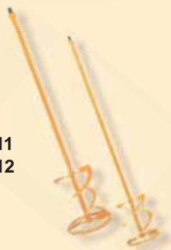
TKW 411 TKW 412