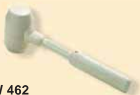
TKW 462 Rubber mallet