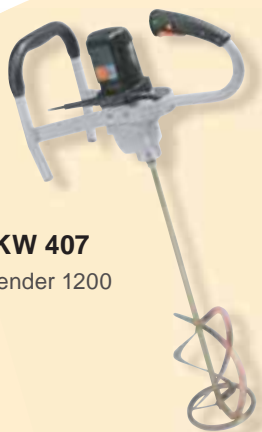
TKW 407 Blender 1200