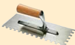
437200 10x10 mm trowel

chanical characteristics of the product. Wait 5-10 minutes, then stir the product briefly again before applying. The creamy paste obtained can be easily applied by trowel and possesses optimum thixotropy.