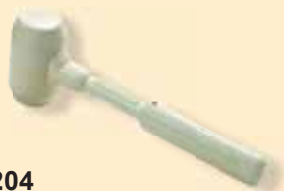
437204 White rubber mallet