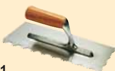
437201 28x12 cm trowel stainless steel 15 mm rounded serrations