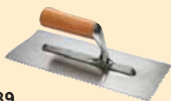
437189 28x12 cm trowel stainless steel 8 mm square serrations