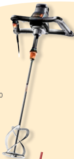
437145 Blender 1200