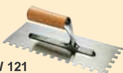
TKW 121 Trowel 10x10 mm