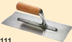
TKW 111 Trowel 8x8 mm