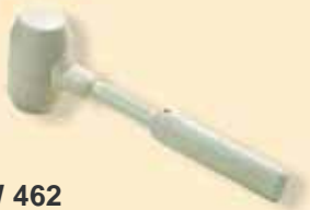
TKW 462 Rubber mallet