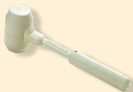
White rubber mallet