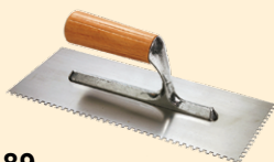
437189 28x12 cm trowel stainless steel 8 mm square serrations