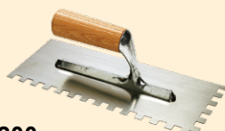
437200 28x12 cm trowel stainless steel 10 mm square serrations