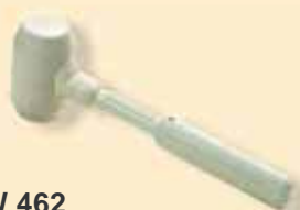
TKW 462 Rubber mallet