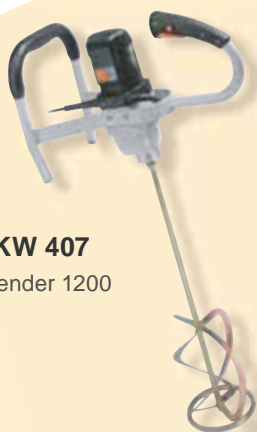
TKW 407 Blender 1200