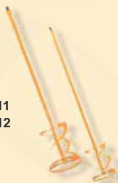
TKW 411 TKW 412