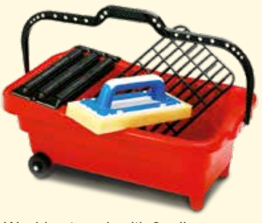
Washing trough with 3 rollers