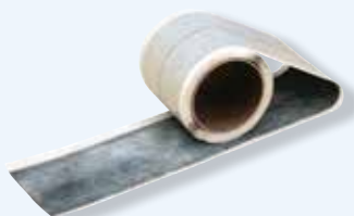
437299 Strip RL 80 S