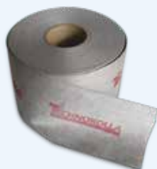
437337 Strip RL 120