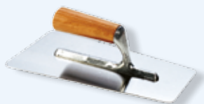
Smooth stainless steel trowel