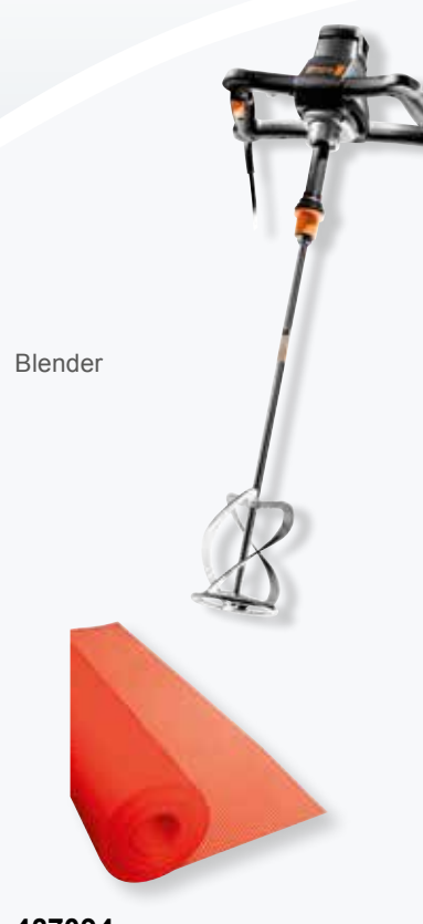
437094 RASOLASTIK NET