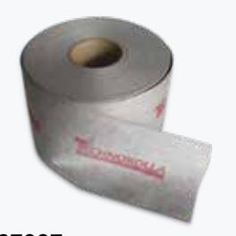
437337 Strip RL 120