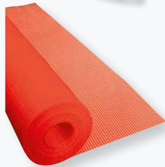
437094 RASOLASTIK NET