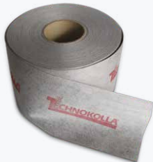
437337 Strip RL 120