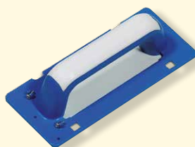
Handle for sponges and felts