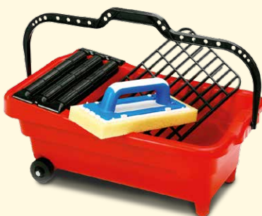
Washing trough with 3 rollers