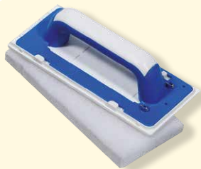
Soft white felt